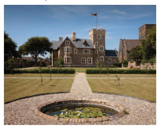
Pugin's The Grange