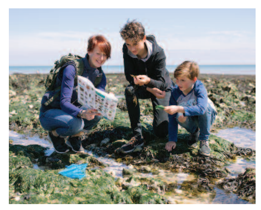
Coastal Explorer Pack