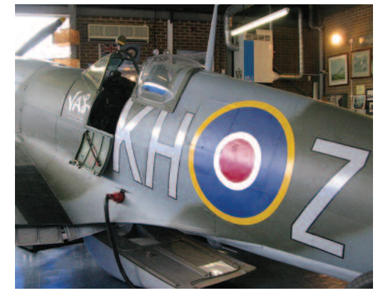
Spitfire and Hurricane Museum