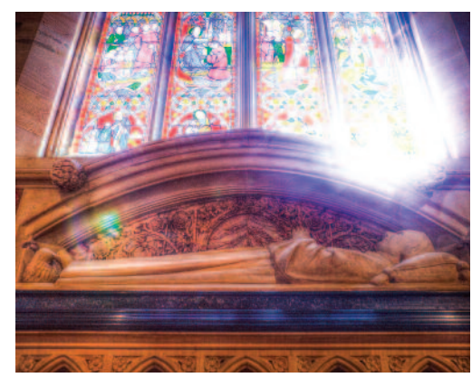
St. Augustine's Church