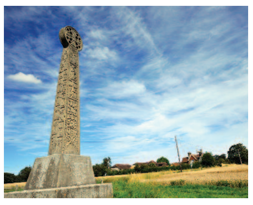
St Augustine's Cross