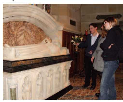
Pugin Tomb at St. Augustine's Church.