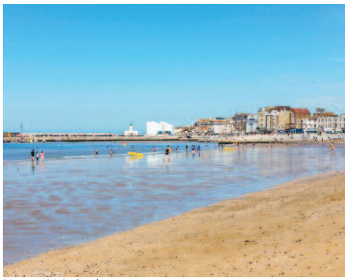
Margate Main Sands