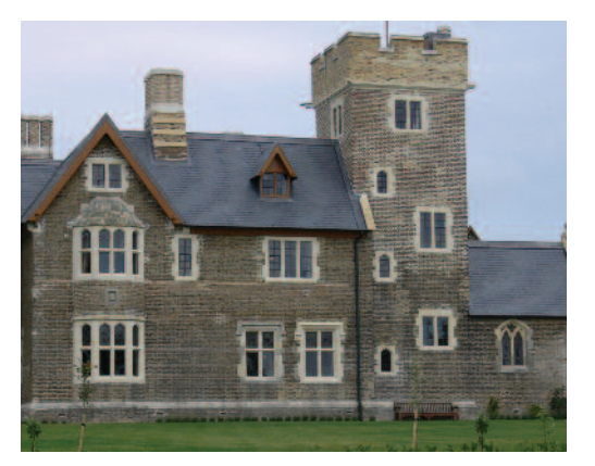
Pugin's The Grange