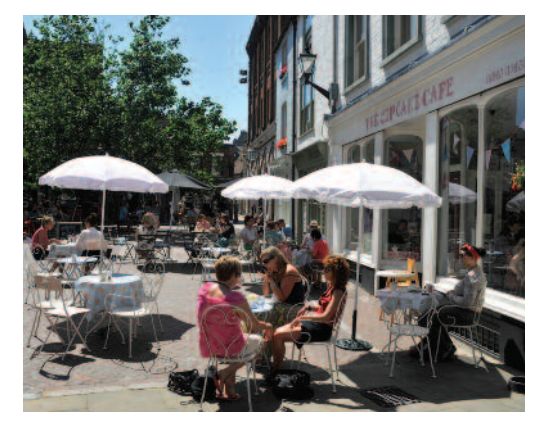
Margate Old Town