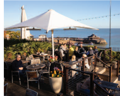
Overlooking Viking Bay