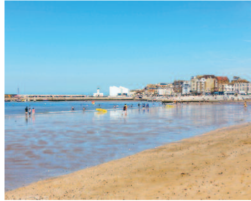
Margate Main Sands