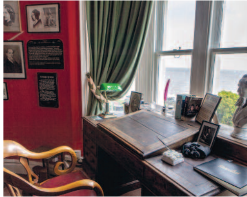
Charles Dicken's Study, Bleak House