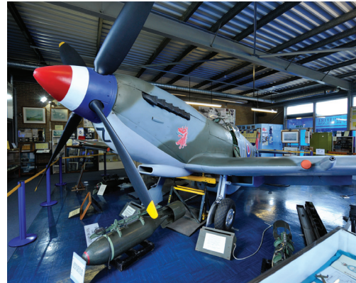
Spitfire and Hurricane Memorial Museum