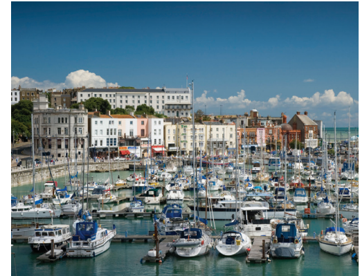
Royal Harbour, Ramsgate