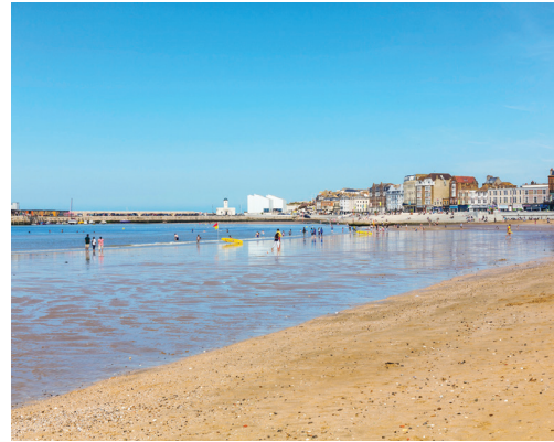
Margate Main Sands