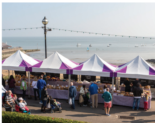
Broadstairs Food Festival

Discover a range of accommodation at www.visitthanet.co.uk/stay-and-eat/places-to-stay/