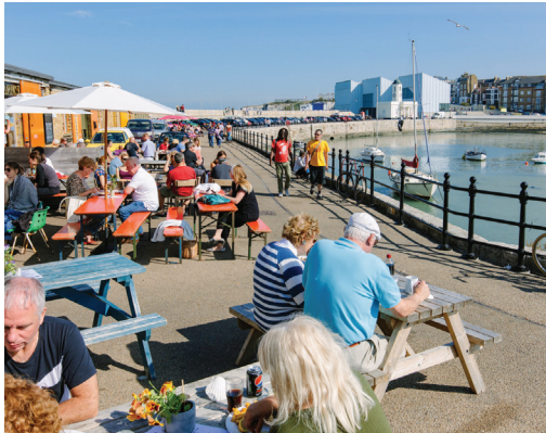
Margate Harbour Arm