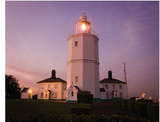
Stone Bay North Dickens House Museum