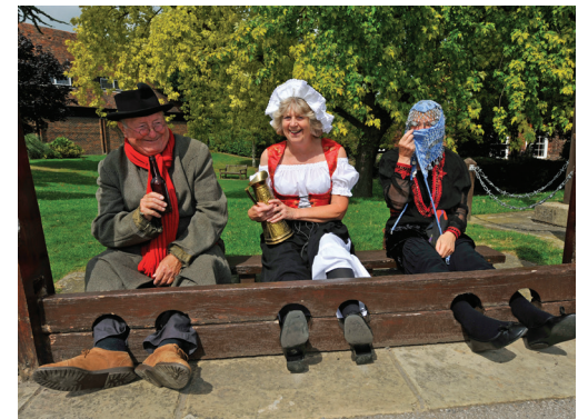
St. Peter's Village Tour