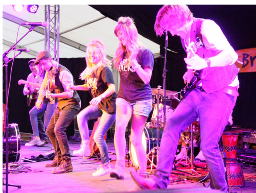
Noble Jacks