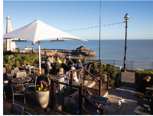
Overlooking Viking Bay