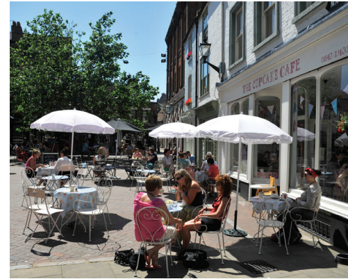
Margate Old Town