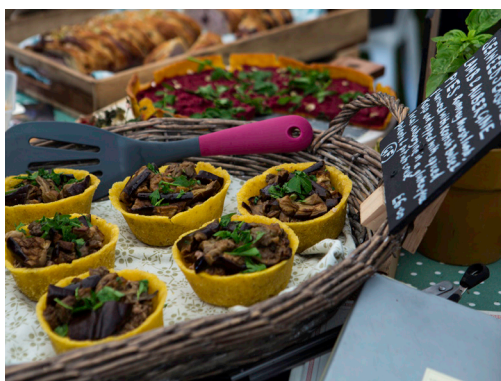
Broadstairs Food Festival