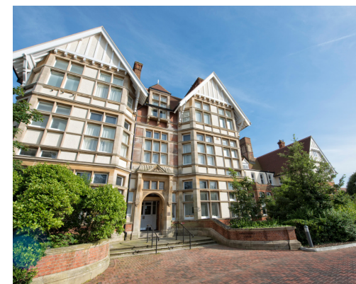
The Yarrow Hotel