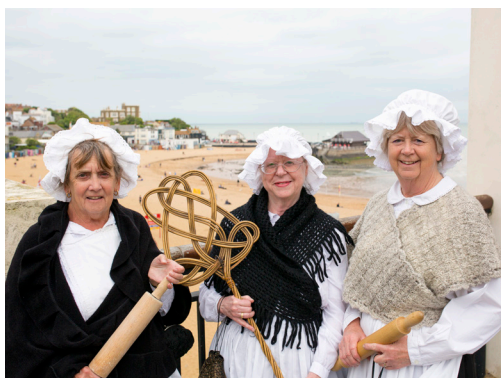
Broadstairs Dickens Festival