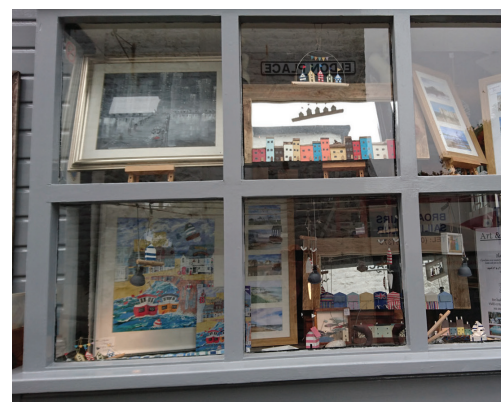
The Little Art Gallery

(2021 Awards applied for and awaiting confirmation)