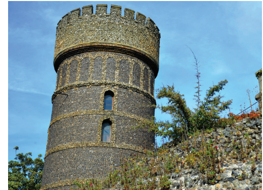
Crampton Tower Museum

Broadstairs Town Walks (guided) take visitors on a gentle stroll through 600 years of history in just under an hour – Charles Dickens, Hans Christian Anderson and Ronnie Barker are all included! Walks take place from Easter to the end of August, weekends only at 2pm from the Information Kiosk by the Albion Hotel.