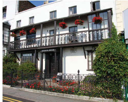
Dickens House Museum