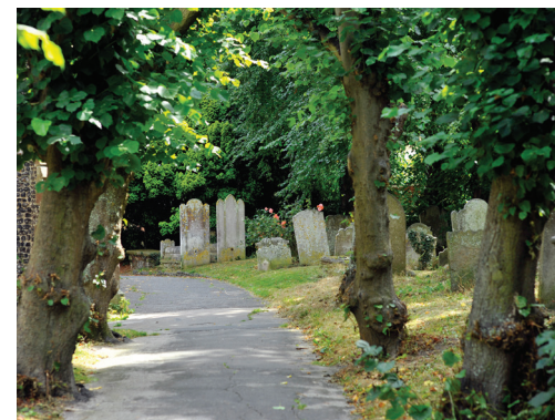
St. Peter's Churchyard