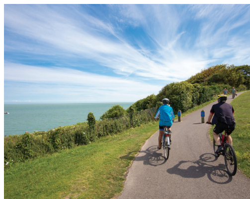
Viking Coastal Trail at Minnis Bay

Turner and Dickens Walk along the restored four-mile route between Dickens’ Broadstairs and Turner’s Margate, much of which follows an ancient footpath between St. Peter’s and St. John’s churches. www.visitthanet.co.uk/turnerand-dickens-walk/