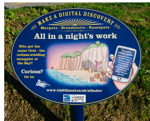
Digital Discovery Packs

Discover the fun of surfing and stand up paddle boarding, SUP, with Joss Bay Surf School www.jossbay.co.uk and Kent Surf School at Viking Bay www.kentsurfschool.co.uk .