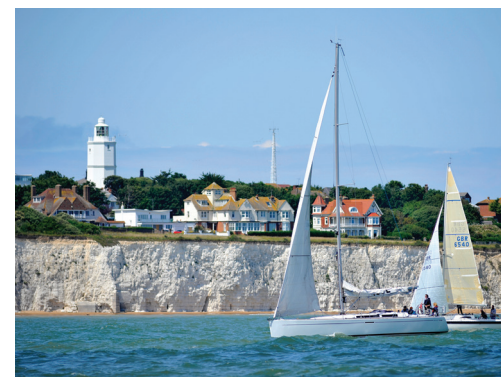
North Foreland Lighthouse