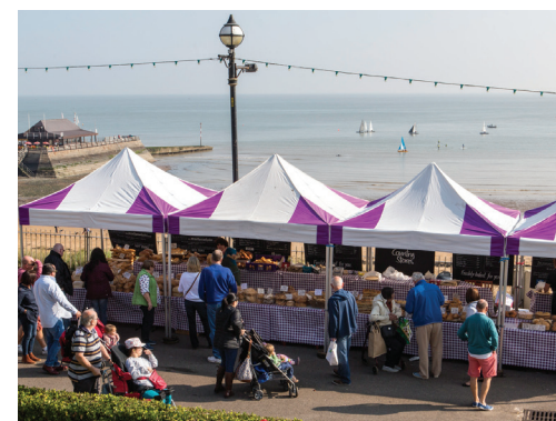
Broadstairs Food Festival

Find full details of Thanet's quality assessed accommodation at www.visitthanet.co.uk/stay-and-eat/places-to-stay/