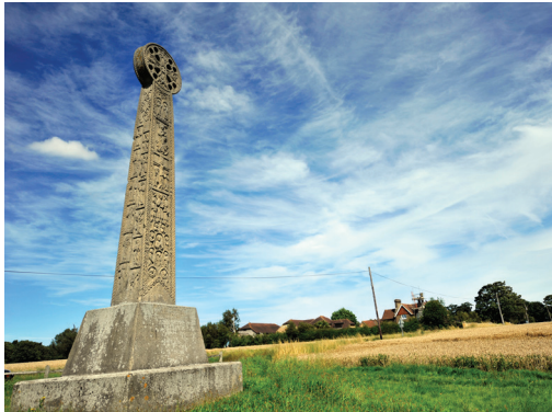
St Augustine's Cross