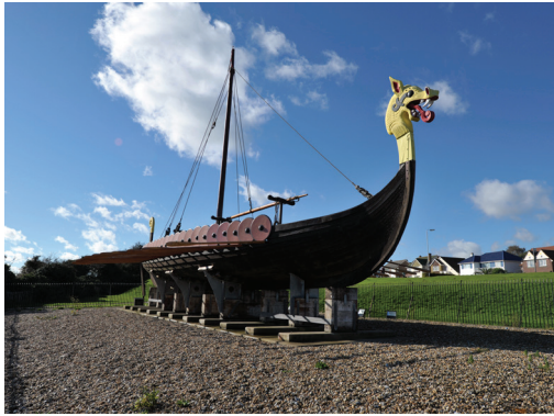
Viking Ship 'Hugin'