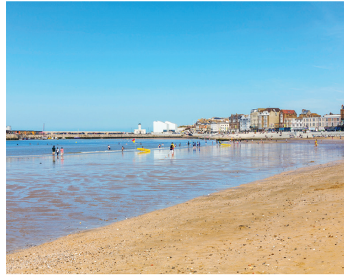
Margate Main Sands