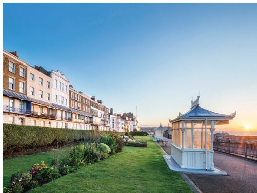
Westcliff, overlooking Royal Harbour, Ramsgate