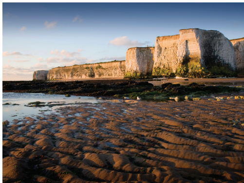
Botany Bay, Broadstairs