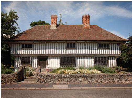
Tudor House, Margate