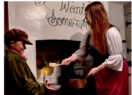
Fagin's Den, Broadstairs