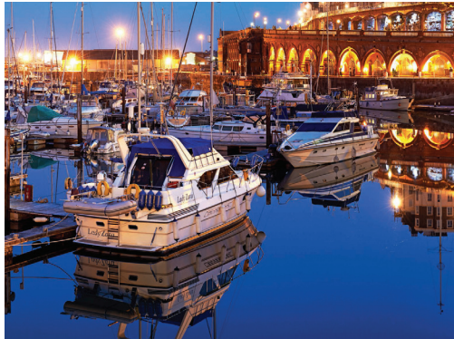
Ramsgate Royal Harbour