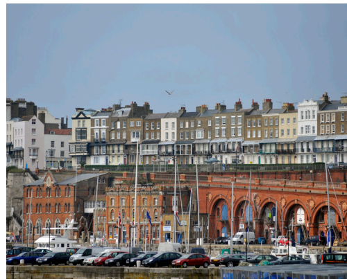
Ramsgate waterfront and Nelson Crescent