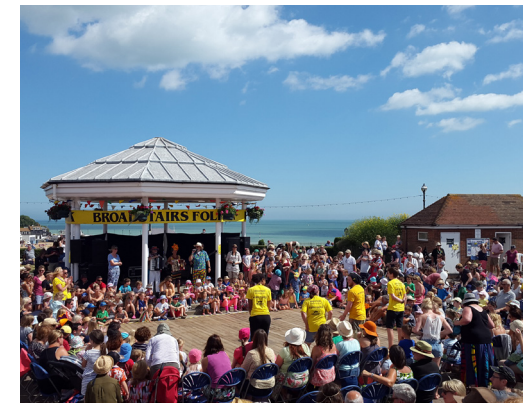
Broadstairs Folk Week