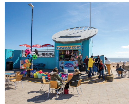
Ramsgate Main Sands