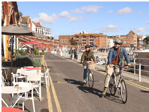
Military Road, Ramsgate

Harbour Street, make improvements to the High Street and repurpose empty buildings for creative and community use.