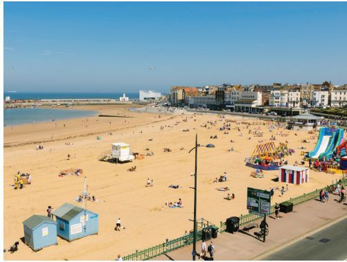
Margate Main Sands