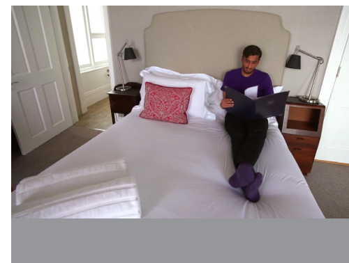
Stylish and chic accommodation