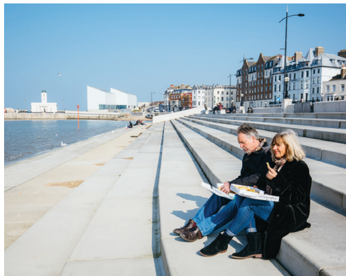
Margate Flood Defences

In September 2020, Ramsgate received High Street Heritage Action Zone status. The scheme under development will seek to rescue and transform some of the historic buildings in