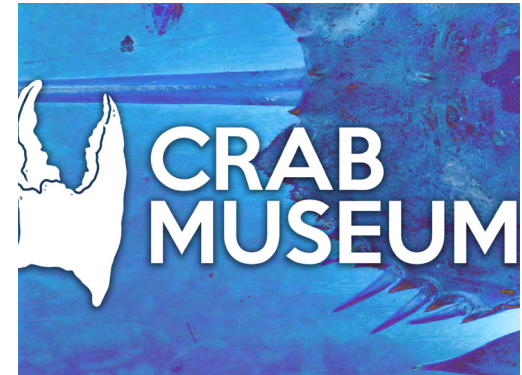
Crab Museum, Margate