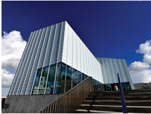
Turner Contemporary, Margate