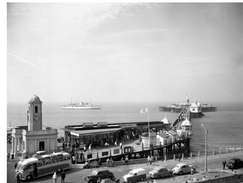
Murky Margate Tours