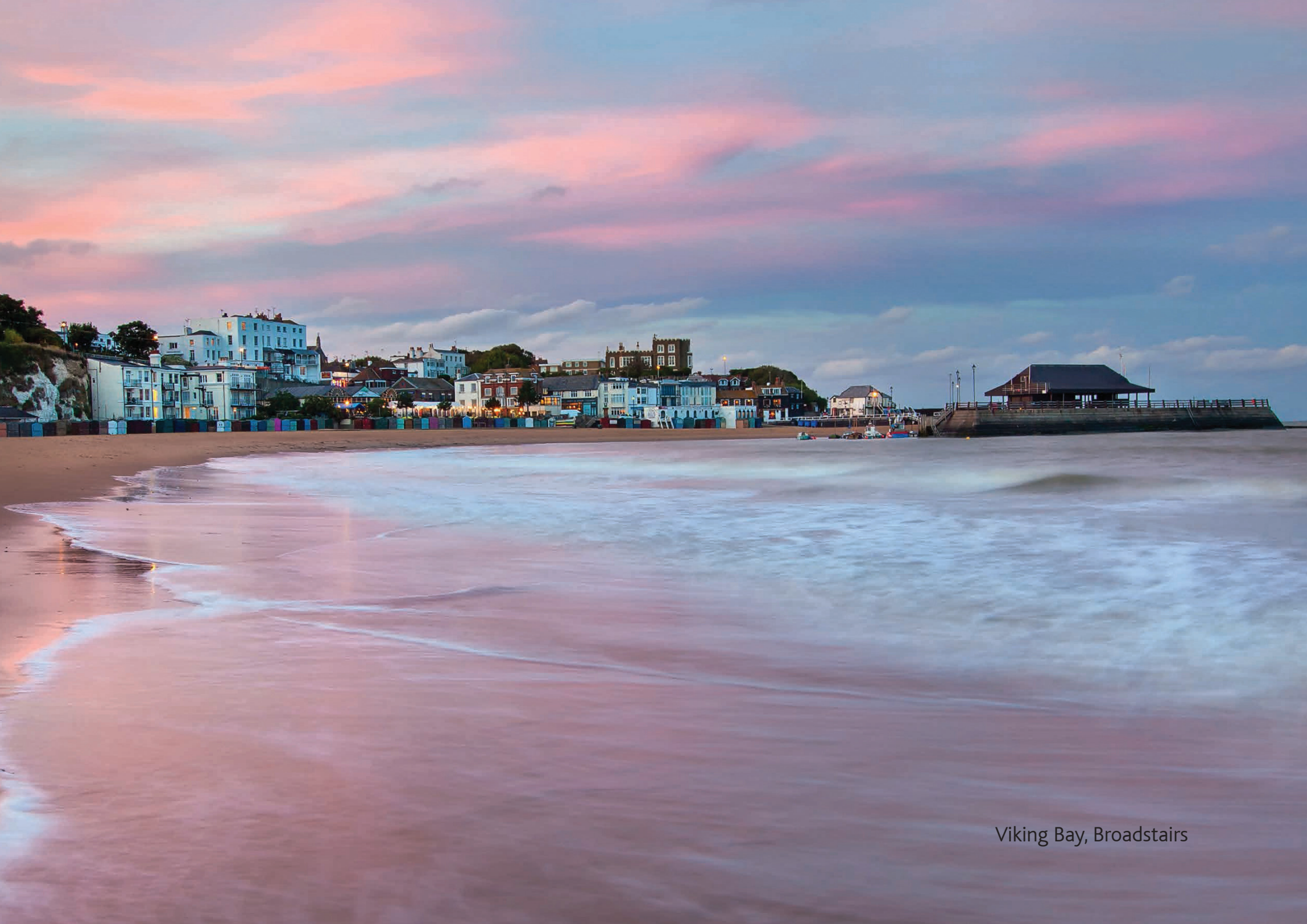
Viking Bay, Broadstairs