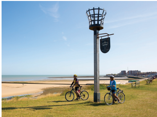
Viking Coastal Trail