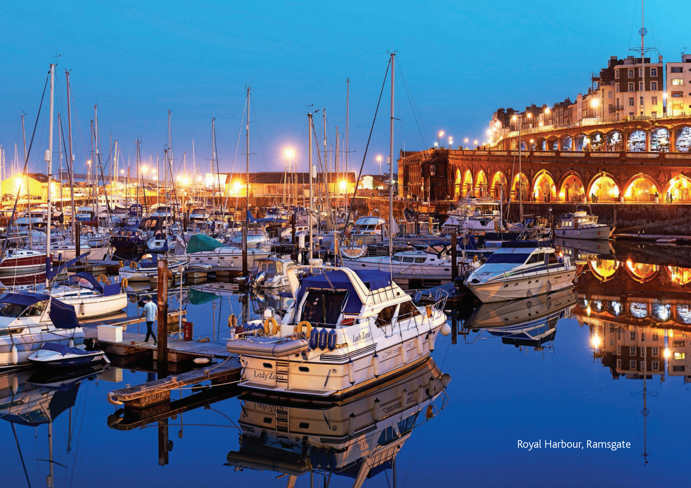
Royal Harbour, Ramsgate