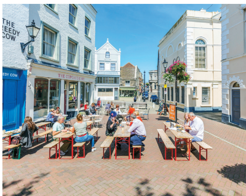
Margate Old Town

From the mid-20th century wider access to package holidays abroad gradually took its toll on the Thanet visitor economy. Increasingly cheaper flights and the rapid growth of resorts in destinations such as Spain meant more people chose to go abroad for their one or two-week family sun and sand holidays. Thanet continued to be popular as a daytrip or weekend destination but many of the larger hotels and guest houses had to close followed by larger entertainment venues.