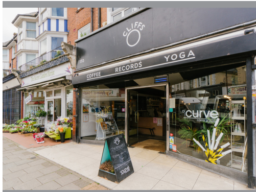
Northdown Road, Cliftonville