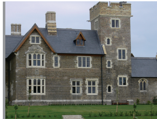
Pugin's The Grange