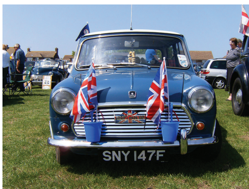
Great Bucket and Spade Run