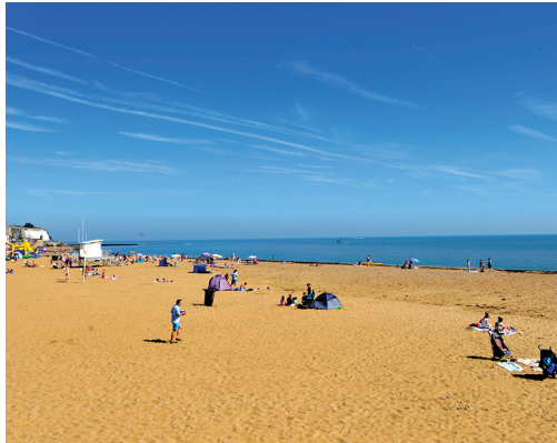
Ramsgate Main Sands