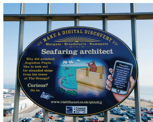
Digital Discoveries Plaques

The town's history and architecture can be discovered further on a variety of self-guided walks including a Pugin Town Trail , tracing Augustus Pugin's architectural legacy, a