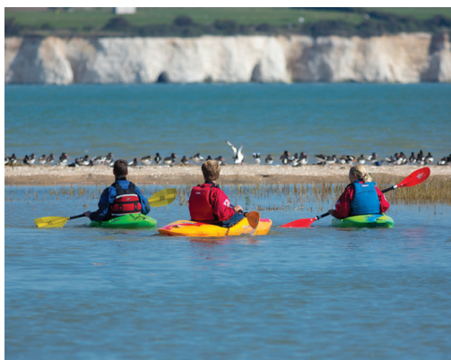
Guided canoe trip

Head out on bike or on foot along the 32-mile (51.4 km) Viking Coastal Trail and discover dramatic scenery and a wealth of local historical gems. The trail can be split into smaller themed sections and is also known as Regional Route 15 of the National Cycle Network www.visitthanet.co.uk/cycling