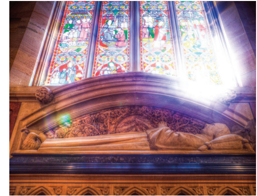
St. Augustine's Church

Jane Austen's brother, Frances Austen (1774-1865), who served as Admiral of the Fleet, lived in Ramsgate. Jane Austen visited him here and in her novel Pride and Prejudice Georgiana Darcy spends a summer in the town.