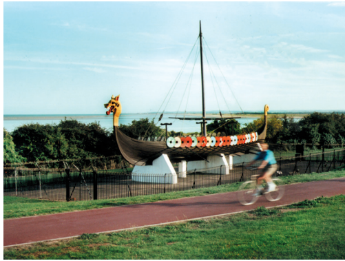
Viking Ship Hugin