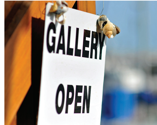
The Little Art Gallery