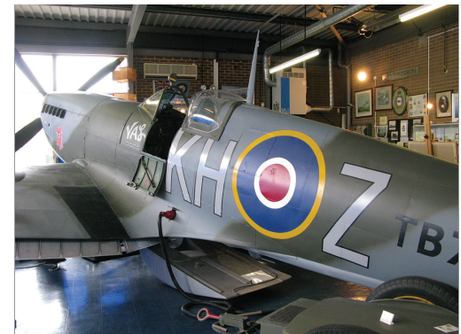
Spitfire and Hurricane Museum