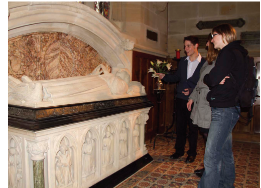
Pugin Tomb at St. Augustine's Church.