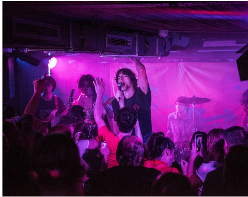
Ramsgate Music Hall