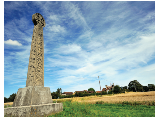
St Augustine's Cross