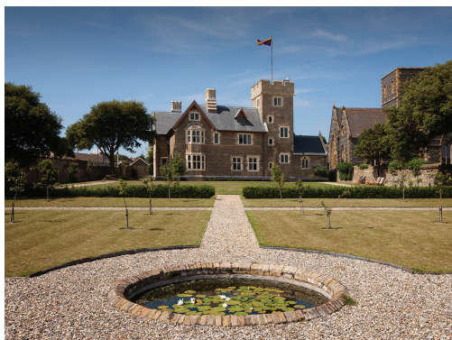
Pugin's The Grange